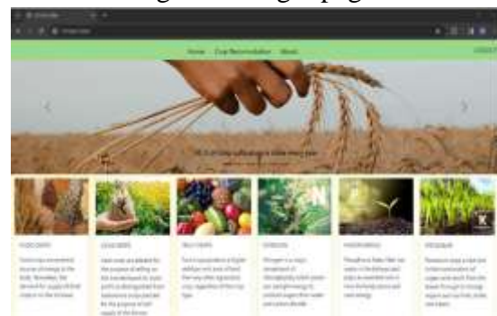
Figure 3: Home Page