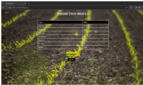
Figure 5: Crop Recommendation Result Page