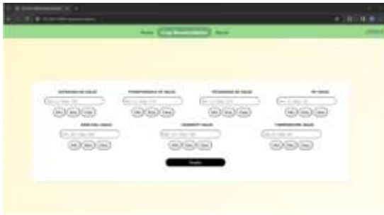
Figure 4: Prediction Page