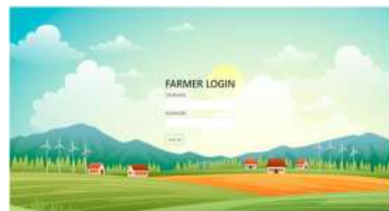
Figure 2: Login page